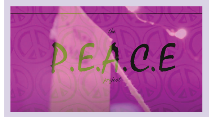
Click here to watch the art show video!

To make the art show happen, the project coordinator mailed out art materials, Uber Eats and taxi vouchers to peer mentors. The art show was an opportunity for increased leadership among peer mentors as they were fully in charge of it.