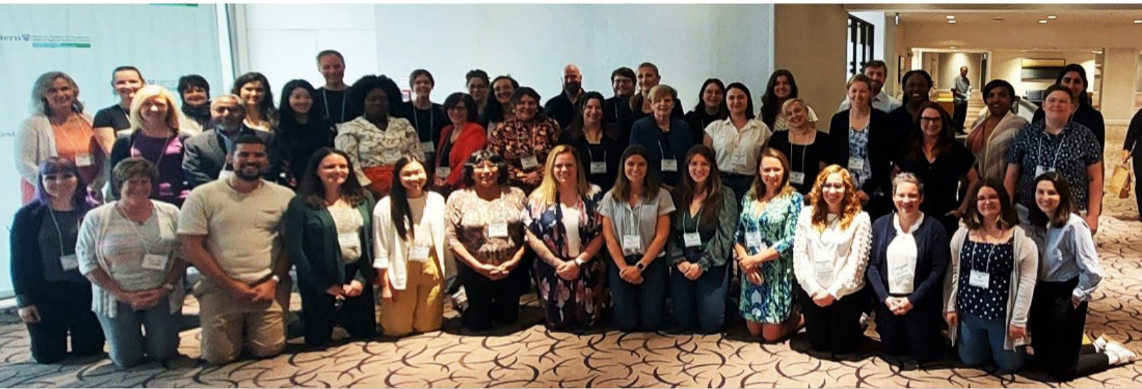
Community of Practice (CoP) members participated in an in-person Knowledge Exchange on June 6 and 7, 2023 in London, ON.

The objectives of the knowledge exchange were to: